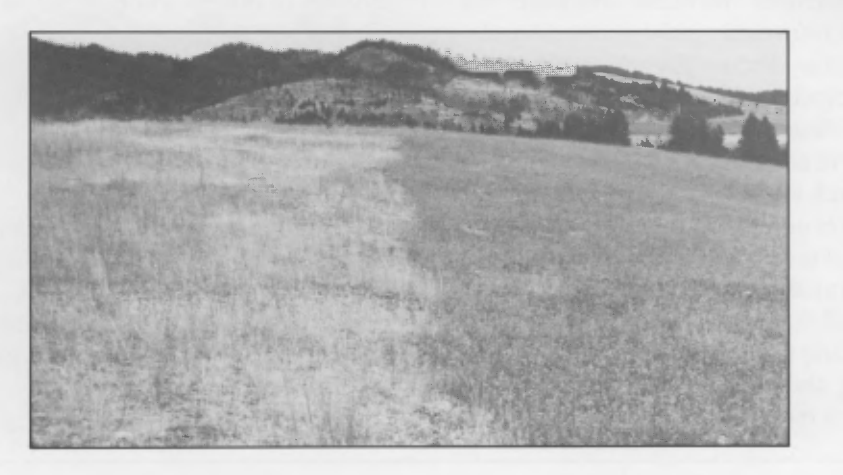
Contrast between the sprayed (left) and non-sprayed site on the McIntyre ranch, Stevensville, MT.

Spotted knapweed averaged 65 lb./acre on the sprayed area compared to 827 lb./acre on the non-sprayed